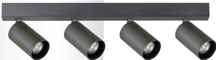
LED COIN 50 COB B

light fitting for ceiling and wall assembly • LED source COIN 50 COB • 355° rotatable and 90° tiltable • housing from aluminium profile • colour option • optional colour of COIN 50 COB cover ring black or white • light source is part of the light fitting • rated median operational life-time of luminaire 50 000h L70/B50 at Ta = 25°C • Standard Deviation Colour Matching MacAdam 2-step • combination of different colour temperature, beam angles, power and CRI possible