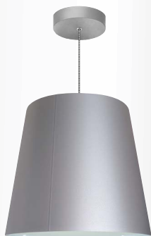
Z683 + ZSL-K

pendant luminaire • vertical position of light source • body made of PETG segments covered with colourful translucent foil • colour option • lower opal cover from PMMA • suspension is ordered separately