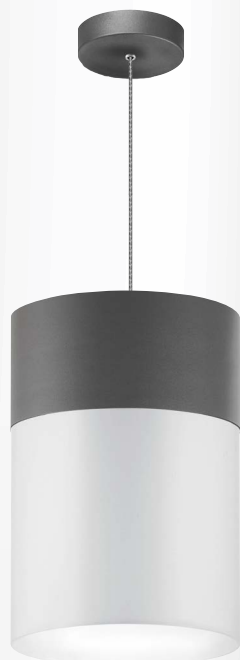
ZSL - K

light fitting with integrated electronic control gear • housing from powder painted sheet • colour option • opal lampshade of PMMA • rated median operational life-time of luminaire 50 000h L70/B50 at Ta = 25°C • Standard Deviation Colour Matching MacAdam 3-step • optional suspension is ordered separately