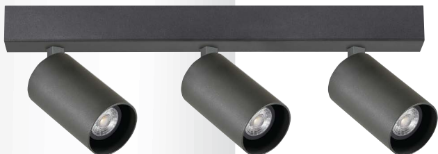
LED COIN 50 COB B

light fitting for ceiling and wall assembly • LED source COIN 50 COB • 355° rotatable and 90° tiltable • housing from aluminium profile • colour option • optional colour of COIN 50 COB cover ring black or white • light source is part of the light fitting • rated median operational life-time of luminaire 50 000h L70/B50 at Ta = 25°C • Standard Deviation Colour Matching MacAdam 2-step • combination of different colour temperature, beam angles, power and CRI possible